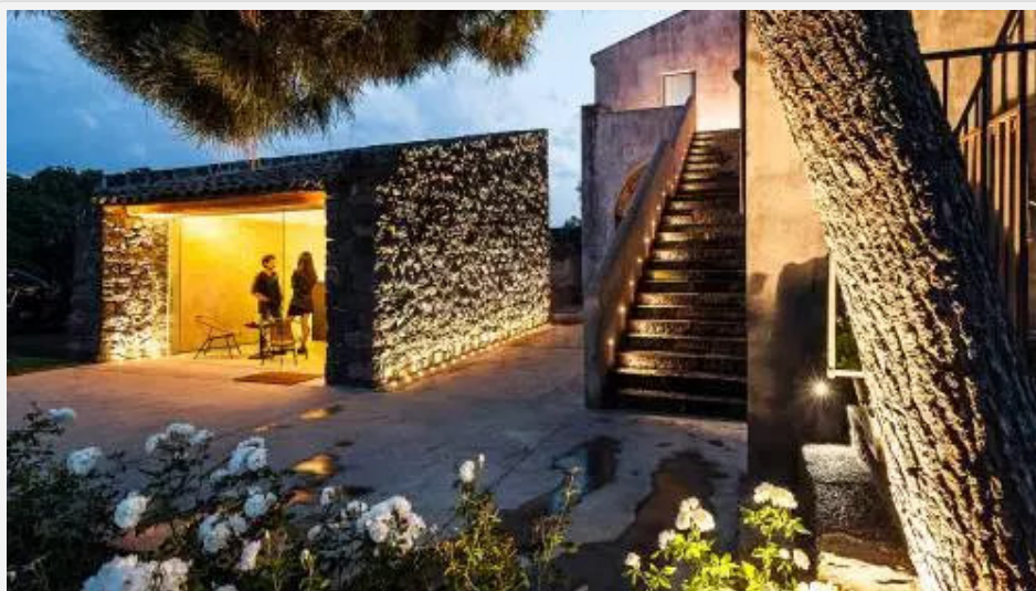
Reception and Stairway to Upper Level

The structure was renovated and expanded from the ruins of an old Masseria, an estate building dating to the 19th Century. There is, however, nothing typical or standard about the white walls, the gorgeous artwork, the large and comfortable bath areas. All of the public and private areas were created to ensure guest comfort and privacy.