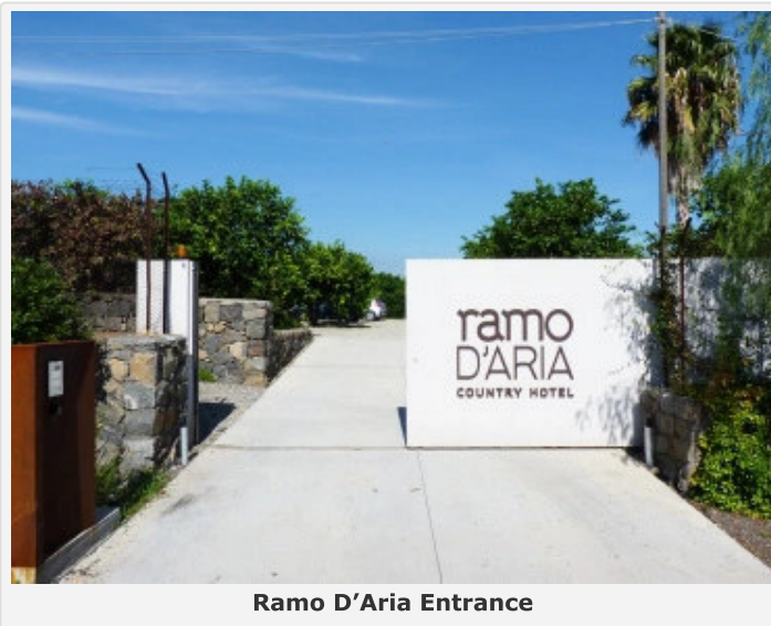
Ramo D’Aria Entrance

Opened for just over five years, the location offers exceptional privacy, a gorgeous pool, easy access to many major sites and activities and a fabulous restaurant; all with unforgettable views of “She”, Mt. Etna.